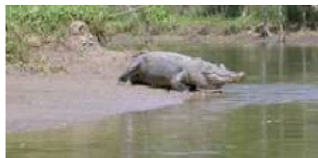
Fatso - Best Dinner Catcher

I have seen as many as sixteen alligators in one four to five hour paddle. Usually I will see five or six in a paddle.