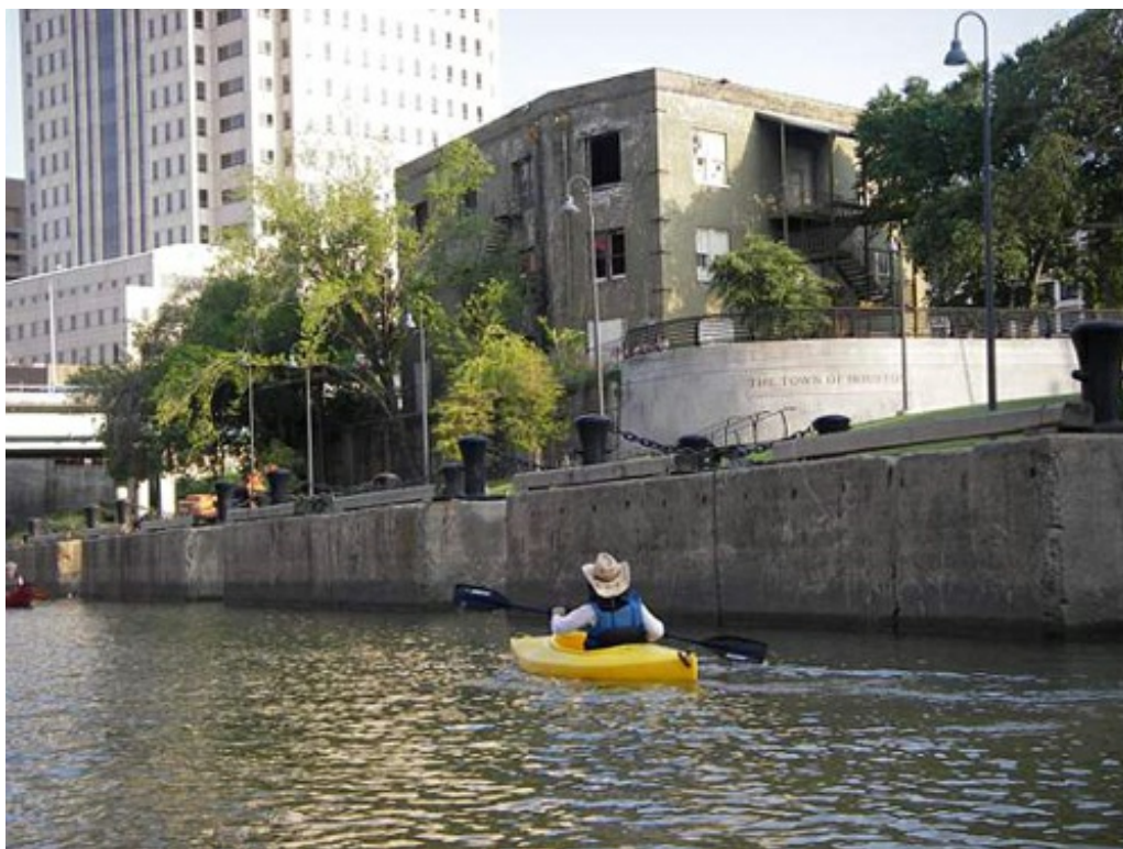
Allen's Landing park. If you look real close (not sure the resolution will support this), you can see "City of Houston". The kayaker is less than a block from City Hall.