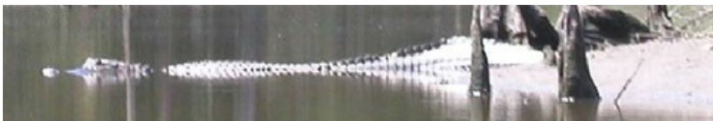
Sunny - Long & Thin

The alligators that I have seen most often, I have named. The female with the babies I call "Momsy", a long thin one I call "Sunny", there is Fatso, Frankie and Johnny are almost always together, and the biggest "El Jette".