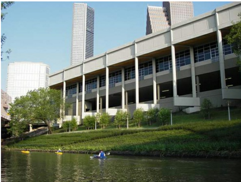
Kayaker taking in Bayou Place, from the bayou

I don't know how many folks signed up, but it was a nice sized group and the bayou looked great from the water, with the banks all cleaned up (but some trash still on the water!) for the Blue Bayou celebration June 10th. This celebrates the improvements on the Sabine to Bagby promenade by the bayou. I've paddled this stretch of Buffalo Bayou over the past 20+ years - infrequently, but what a dramatic change over time. The City of Houston and Buffalo Bayou Partnership should be justly proud!