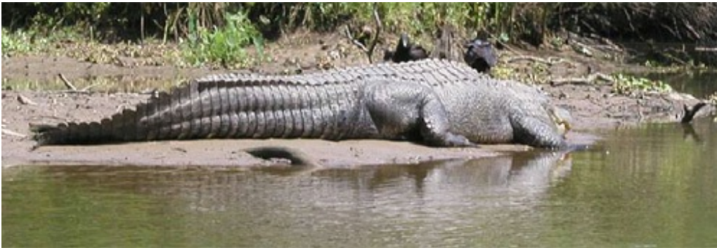
El Jette - King of the Bayou

"Momsy" has moved away from her nesting area since mid-May. I assume she has moved off to find a mate. I fully expect her to return to this area in late August or September to rebuild her nest and lay eggs.