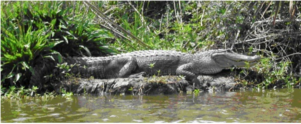
Momsy - Standing Watch over Young

"Momsy" has moved away from her nesting area since mid-May. I assume she has moved off to find a mate. I fully expect her to return to this area in late August or September to rebuild her nest and lay eggs.