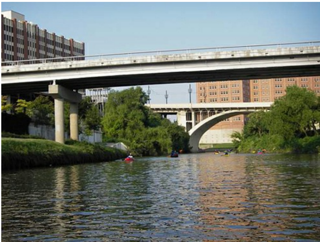
Right downtown, looking at the Main Street bridge and a part of the University of Houston downtown campus.