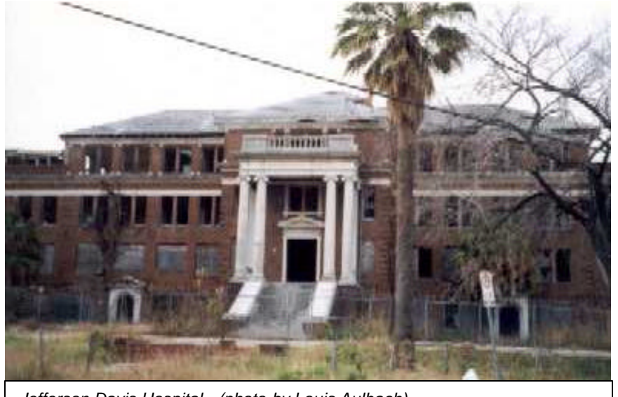
Jefferson Davis Hospital

The Jeff Davis Hospital was built on a parcel of land that is northwest of the Sesquicentennial Park on Buffalo Bayou. It is located behind the Post Office, across the railroad tracks and beyond the elevated I-45 on Elder St near the Fire Department headquarters on Dart St. Built as Houston's first public charity hospital in 1925, it was soon overcrowded and was replaced by the new Jefferson Davis Hospital on Allen Parkway